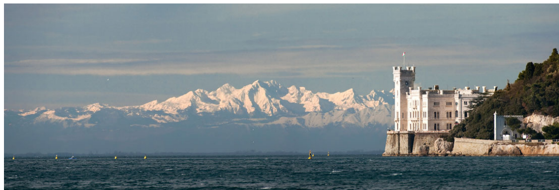
Trieste, Friuli Venezia Giulia